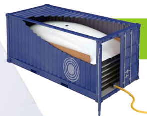
Flexi Tank 22.000 kg