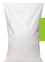
Polypropylene bag 25 / 50 kg