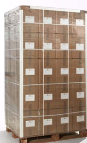
Compact pallet 1.000 kg