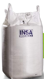
Big Bag 1.250 kg