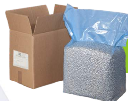
Vacuum packaging 10 / 25 kg